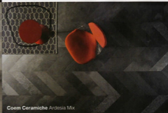
Coem Ceramiche Ardesia Mix

“ We use sustainable practices that set the standard for our field. ”