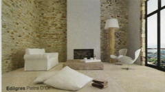
Edilgres Pietra D'Oro

“ When you think of tile, when you think of design, when you think of what will last... ”