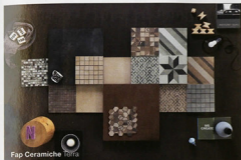
Fap Ceramiche Terra

“ Our tile can be humble. It can be majestic. It can be shaped in an infinite number of ways. ”